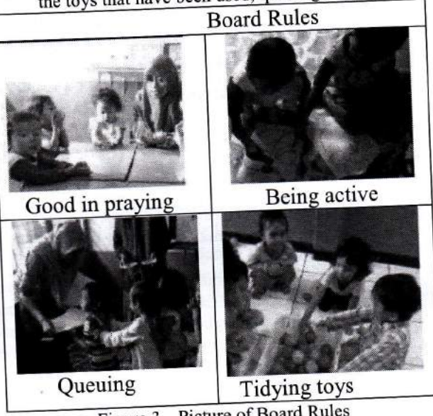
Figure 3. Picture of Board Rules

a. Type of positive habits that will be observed in token models such as being good attitude of pray, being active in learning, smoothing back the toys that have been used, queuing and so on