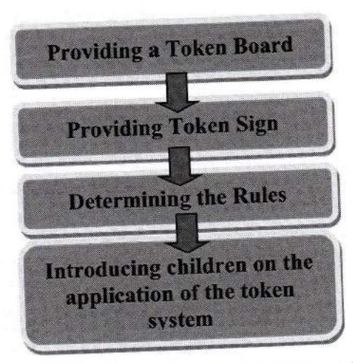
Figure 1. The preparation stage of implementation economy token model